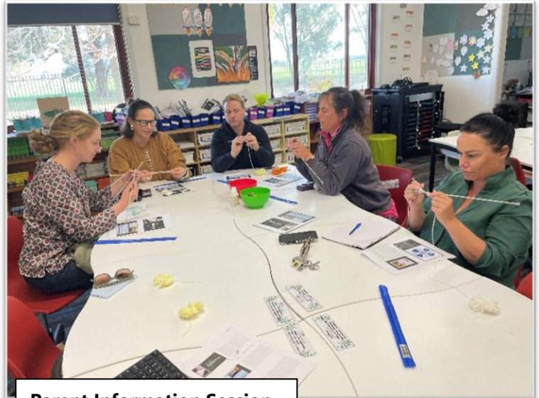
Parent Information Session