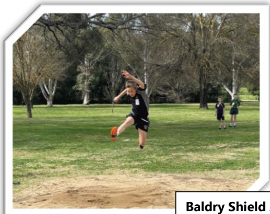
Baldry Shield Athletics