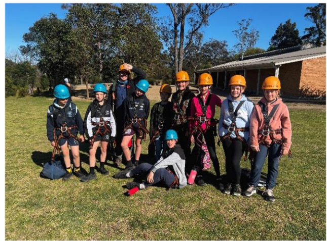
Packing up sad faces!