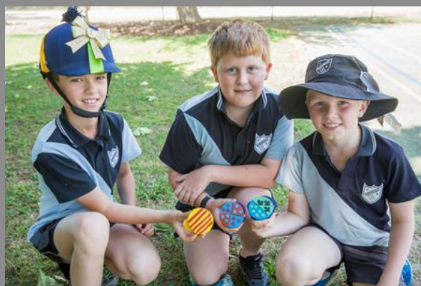
Melbourne Cup 2020